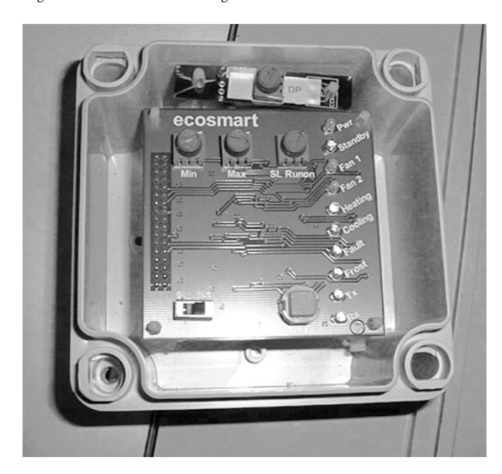
Figure 5. Fan side commissioning box.