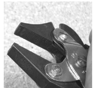
Figure 3. Parallel action pliers.